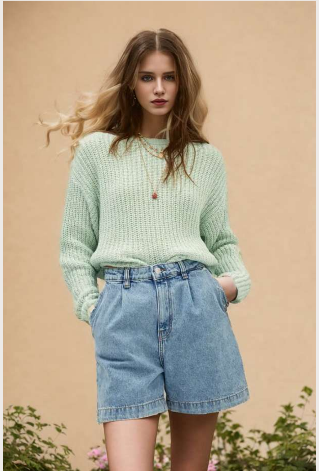
Round Neck Long Sleeve Drop Stitched Knitted Sweater