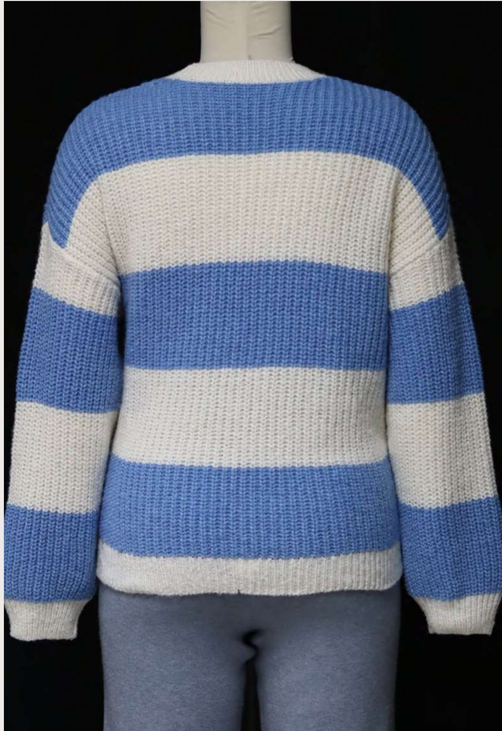
Round Neck Long Sleeve Drop Stitched Knitted Sweater