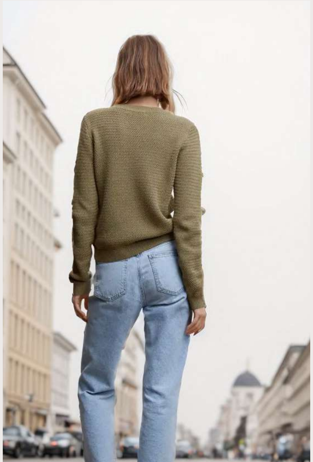
Round Neck Long Sleeve all over Zigzag Knitted Sweater