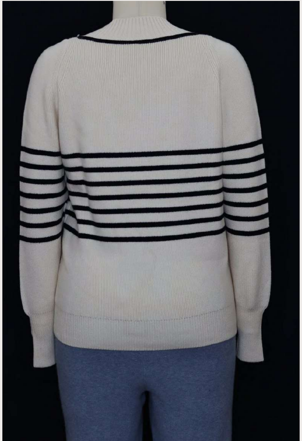
V-Neck Jersey Knitted Sweater