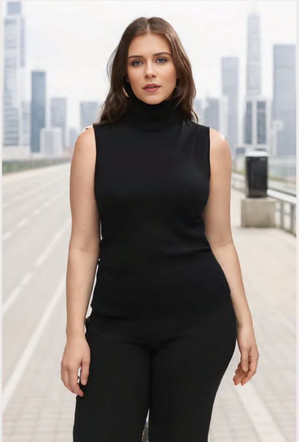
Turtle Neck Sleeveless 1x1 Rib Knitted Sweater