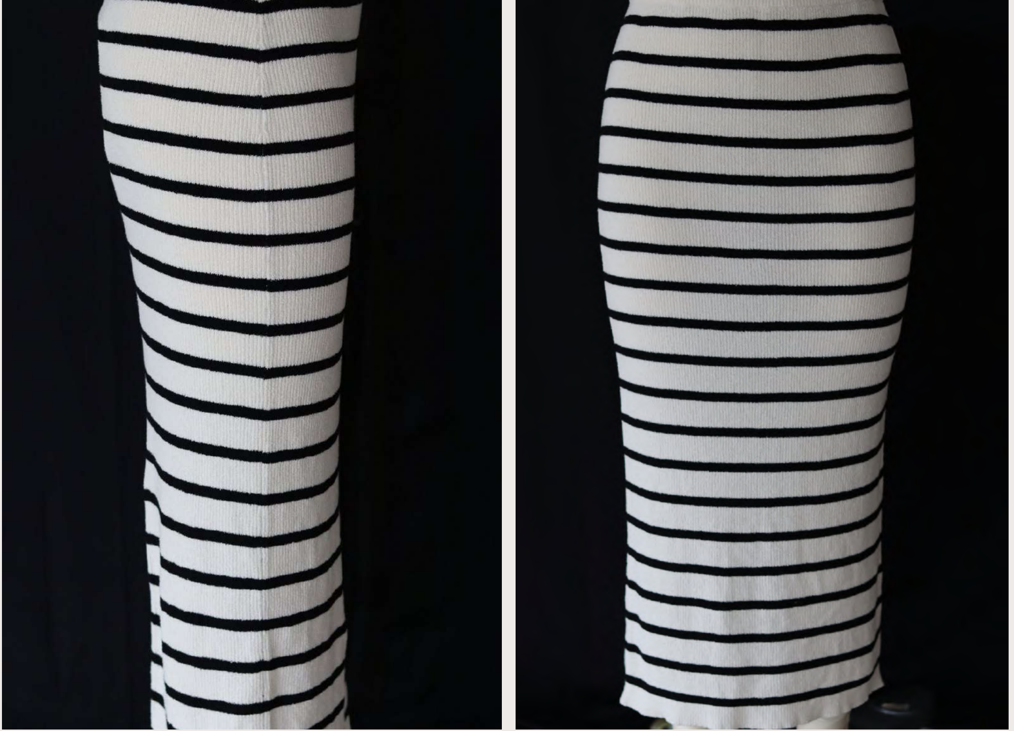
Rib Knitted Ladies Long Skirt