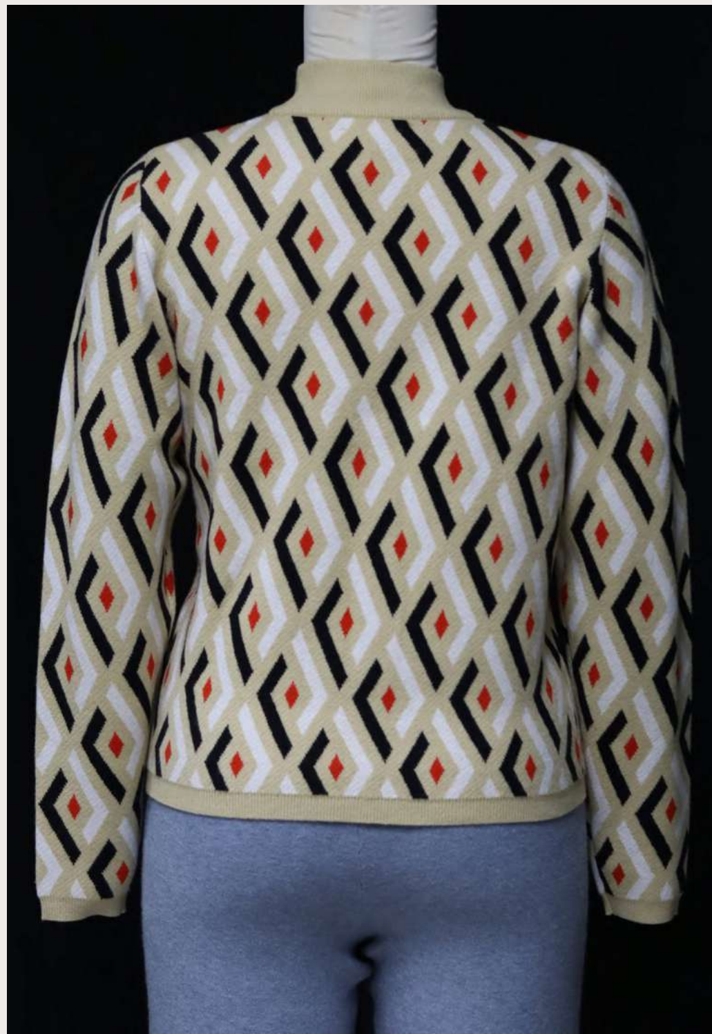
Round Neck Long Sleeve all-over Jacquard Knitted Sweater