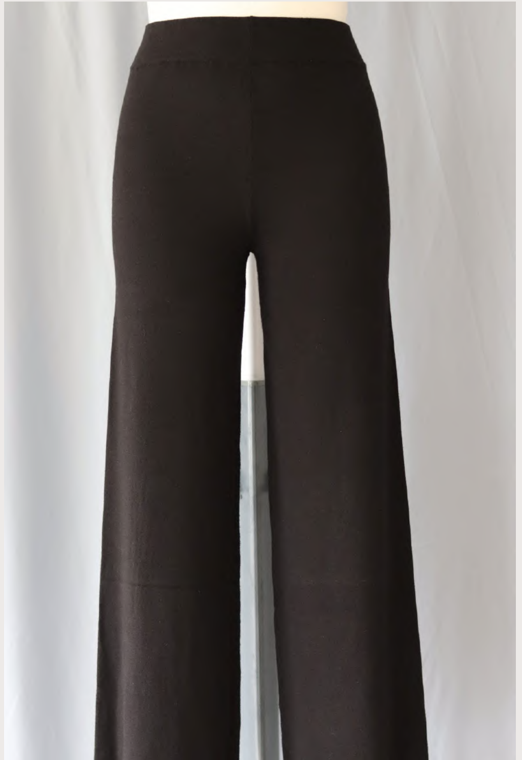
Jersey Knitted Ladies Trouser