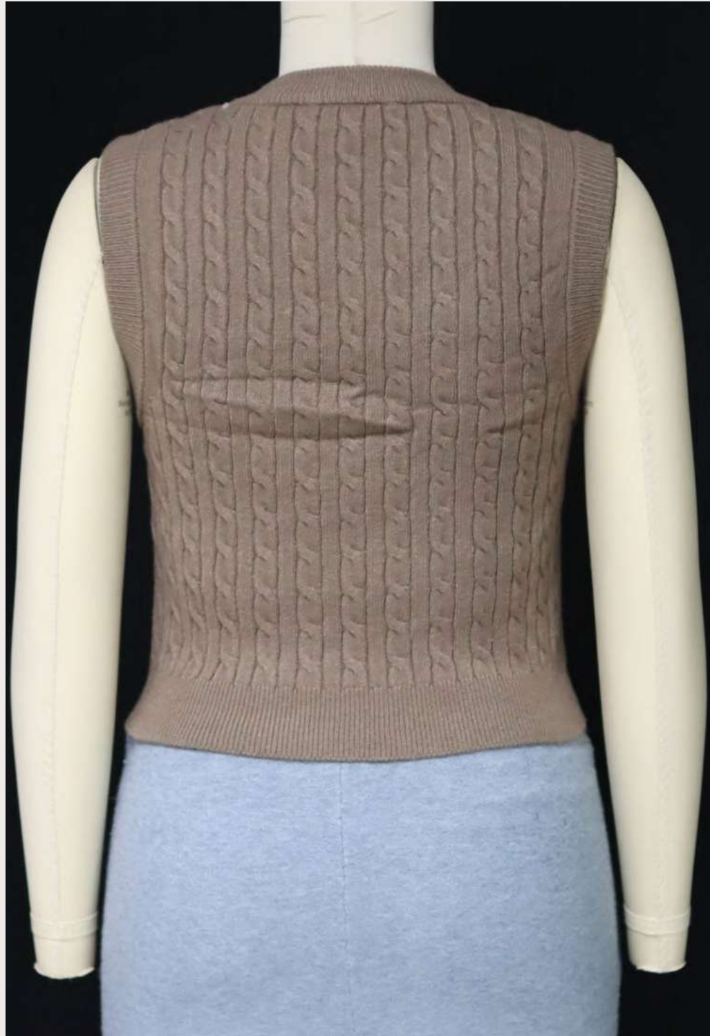
V-Neck all over Cable Knitted Vest