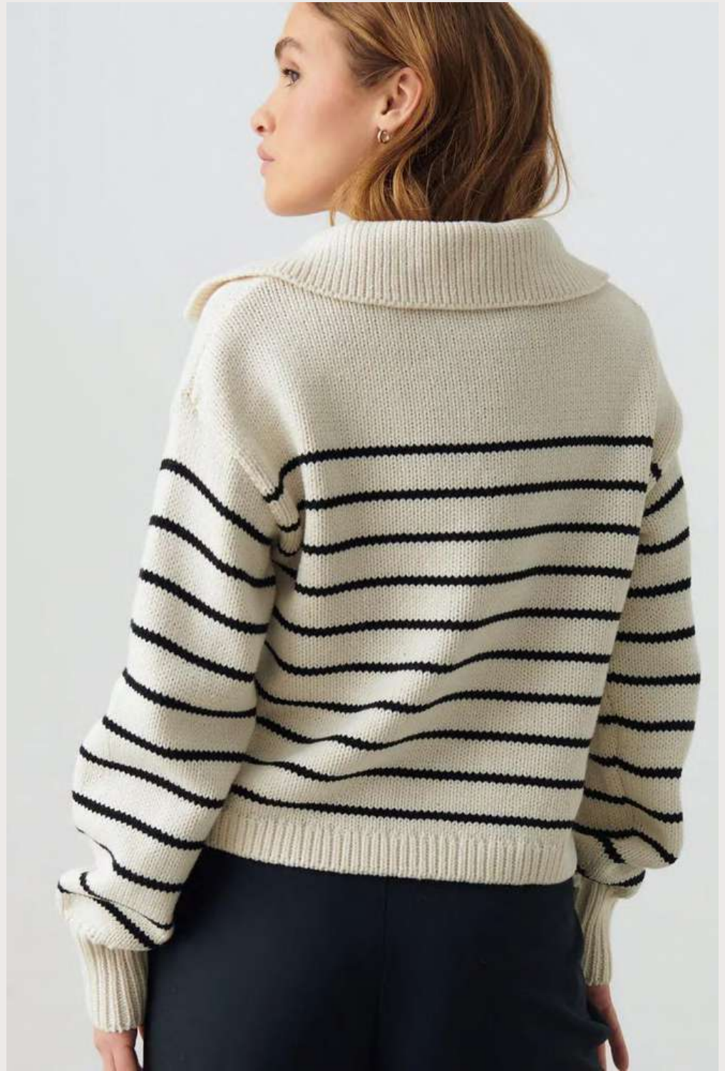
Polo Neck Long Sleeve Jersey Knitted Sweater