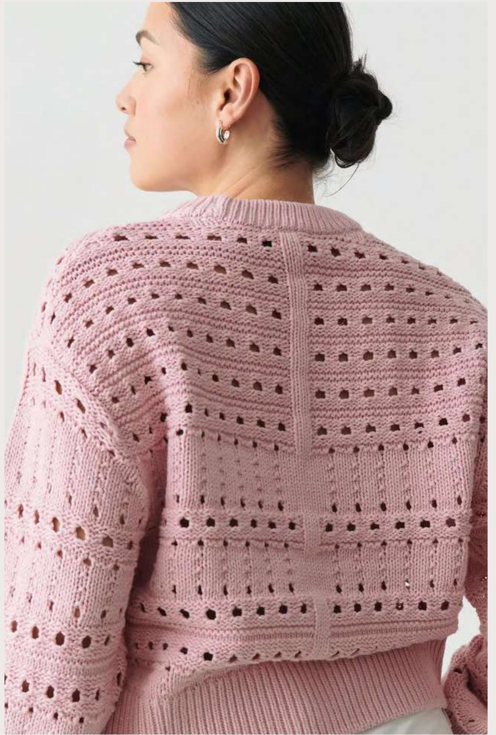
Round Neck Long Sleeve all over Pointel Knitted Sweater